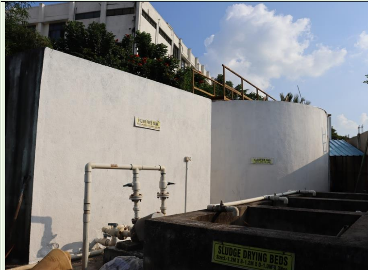
Filter Feed , Clarifier and Sludge drying Beds