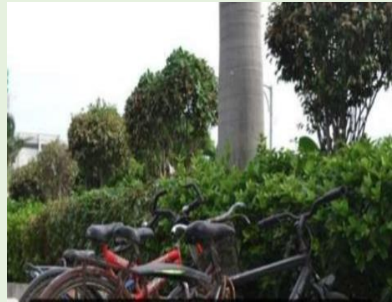
Free to rent bicycle on campus