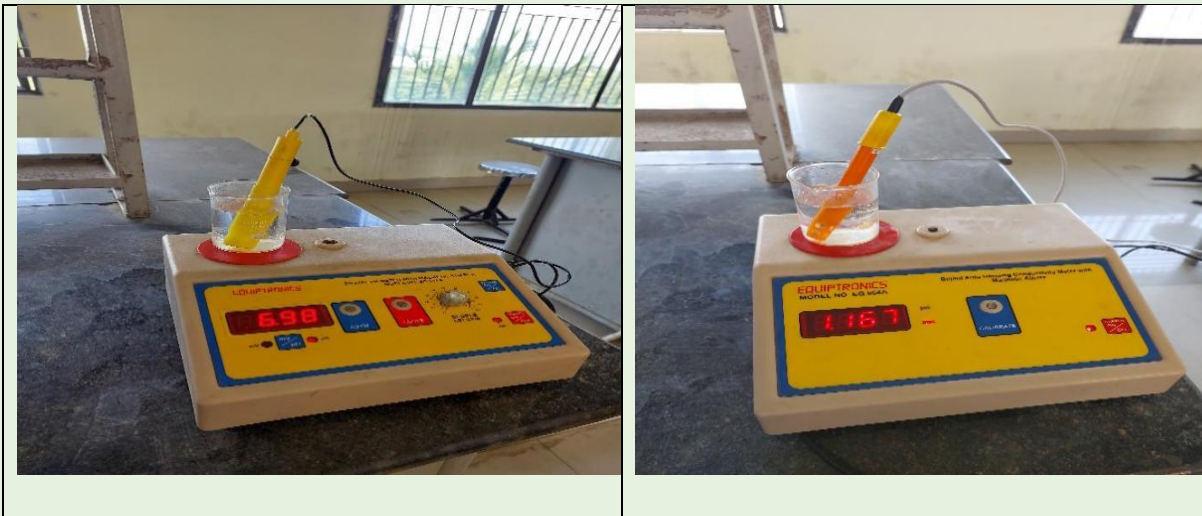
Water sample tested in Laboratory