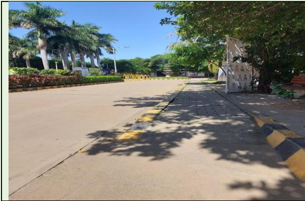
Well-Laiden Pedestrian at CIT Entrance

The campus pathways are ecofriendly with separators between the roads and pedestrian paths. The pathways are provided with lamps throughout for ease in night time. Ramps are provided in parallel to conventional access at all entry points. Major pathways are designed with paverblocks such that the water percolation to the ground recharges normally.