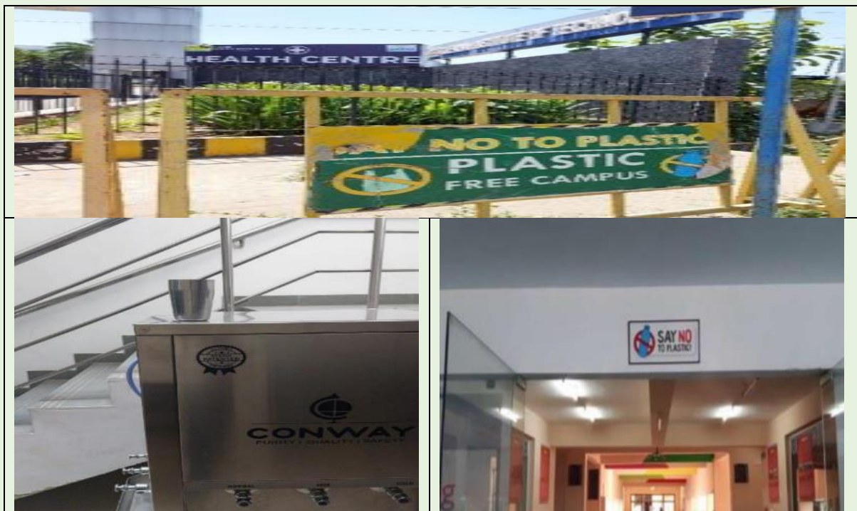
Promoting “No Plastic” in campus

Initiation to support a cleaner, greener campus, our college has rolled out a comprehensive program to significantly reduce plastic waste. This includes initiatives such as eliminating single-use plastics, promoting reusable alternatives, and increasing recycling efforts to minimize plastic pollution and foster a more sustainable campus environment.