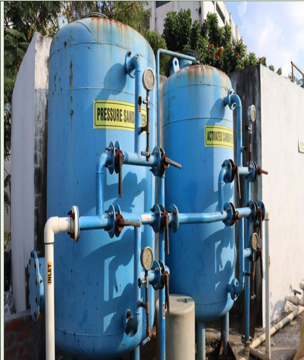
Pressure Filter Units

activated sludge process to break down organic materials. Through filtration, chemical coagulation, nutrient removal (phosphorus and nitrogen), and disinfection with chlorine, UV radiation, or ozone to get rid of any lingering pathogens, tertiary (advanced) treatment further enhances the quality of the water.