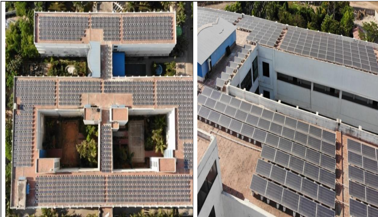
Roof Mounted Solar Panels (Chennai Institute of Technology)

Disposal of food and vegetable waste from hostel mess has been an perennial issue for the hostel administration. A biogas plant of has been installed towards utilisation of these food/vegetable waste for biogas generation to reduce the dependence of LPG.