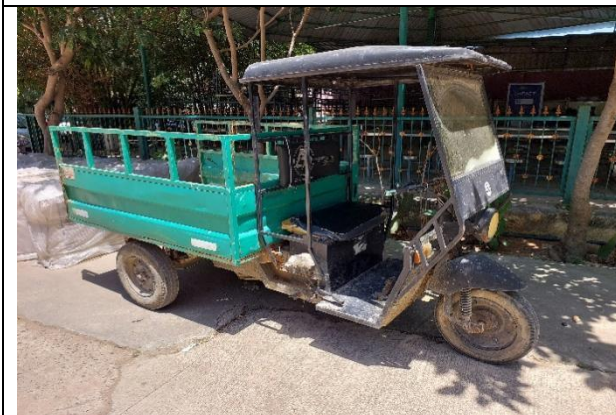
Electric vehicle load carrier (CIT)