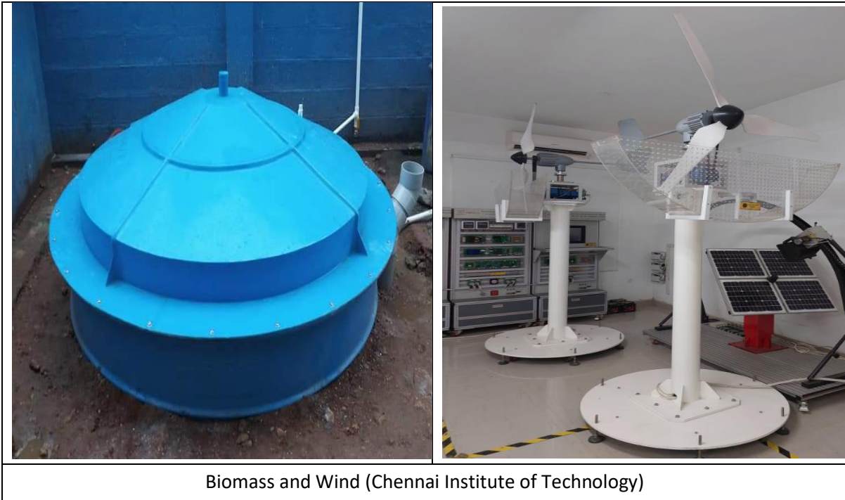
Biomass and Wind (Chennai Institute of Technology)