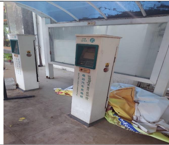
Charging points for EV