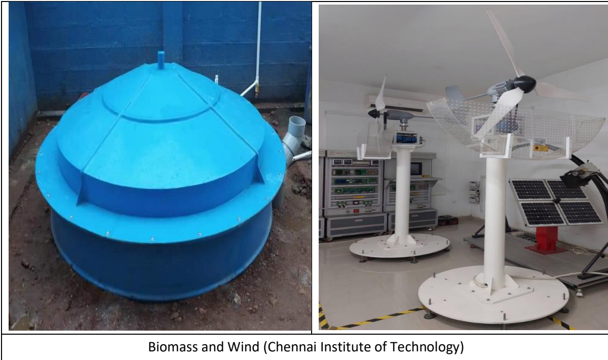
Biomass and Wind (Chennai Institute of Technology)