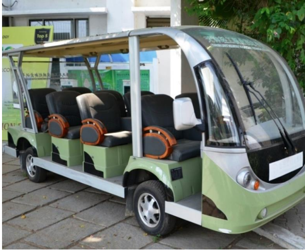
Electric Vehicle (Chennai Institute of Technology)