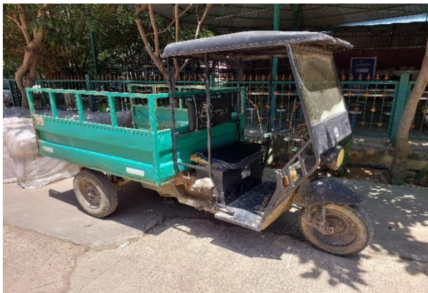
Electric Vehicle-Load Carrying (Chennai Institute of Technology)