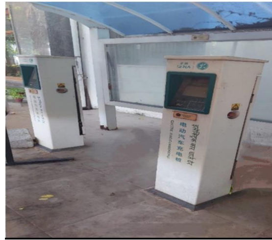
Charging points for EV (Chennai Institute of Technology)